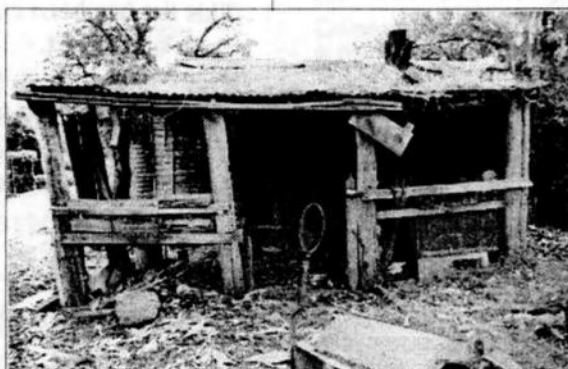
Blacksmiths shop at Hawksview