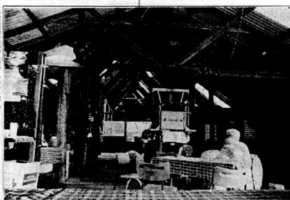
Wool room at Hawksview