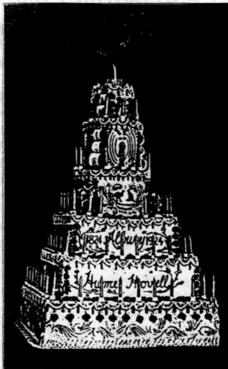
Albury's Centenary Birthday Cake Hume & Hovell Celebrations