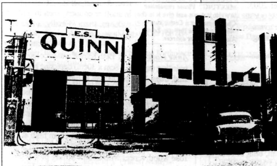
Malcolm's Hall, in Kiewa Street, on right. (BMM 23/11/1957)