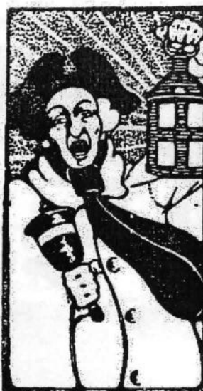
Illustration inside 1890-1920's Xmas card: the Town Crier, mediaeval antecedent to newspaper publishing.

Beat egg yolks, butter, gradually add sugar and beat until frothy. In saucepan soften gelatine in water and bring to boil over low heat; slowly pour into egg mixture beating well all the time. Whip cream until stiff and fold into egg mixture, then