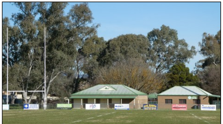
Greenfield Park playing field and pavilions