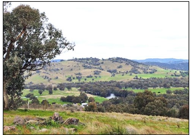
Looking south to the river and Huon Hill

“I loved the constant view of bush that encircled every day of my life. I loved the sound of the wind ripping across the ridge bearing down on the eucalypts in a warning of storm that would send Mum into a panic. “Bring in the sheets and towels!” And I could see it all from my bedroom window. I loved the threat of snakes in your own backyard, echidnas climbing up your drain pipes, the call of birds migrating over a boy’s bedroom ceiling, signalling their descent onto the billabongs that lay in the intestines of the old river.”