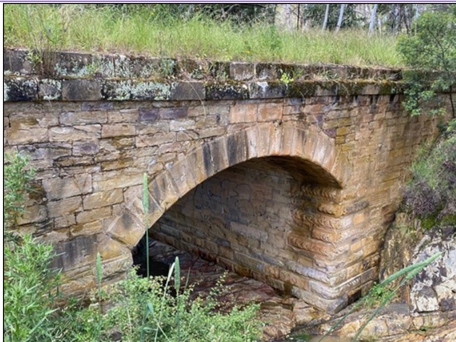
The convict built masonry bridge constructed across Towrang Creek, still visible today from the Derrick VC rest area (see page 2).