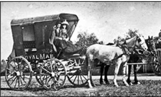
The Royal Mail arrives at Bowna, north of Albury, in the late 1800s

Albury was declared the official crossing place of the Hume (Murray) River in 1839. In October of the same year the Government Gazette invited tenders for the Sydney to Melbourne mail run. The contract stipulated that mail was to leave the Sydney General Post-office at 5pm every Saturday, arriving in Albury on Thursday evening. Leaving Albury the next morning at 6am, it would arrive at Melbourne by noon on Monday. The return mail would leave Melbourne at noon Thursday and travel back, reaching Sydney nine days later, the whole journey taking twenty-one days. The mailman would then be given nine hours rest before heading off again.