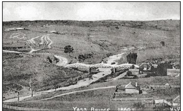
The first bridge over the river at Yass, 1860.

From Goulburn to Albury very little construction work had been undertaken and the road remained nothing but a track. The southward expansion of the rail system during the 1860s and 1870s became a more important priority than road construction and maintenance.