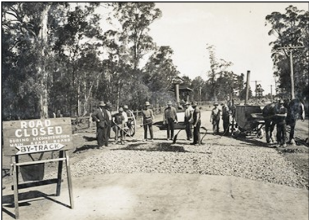
Sealing the Great Southern Road at Tahmoor, 1926

The arrival of the motor car in the early 1900s rejuvenated efforts to upgrade Australian roads. With the passing of the Main Roads Act 1924 , the Great Southern Road became eligible for assistance from State Government. The same act proclaimed the road a State highway named the Hume Highway.