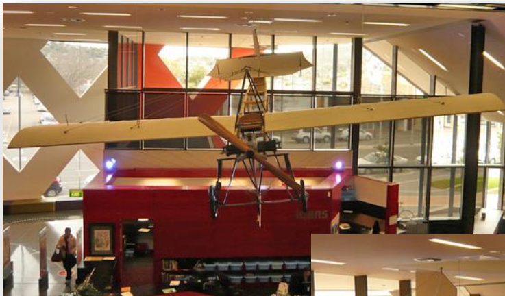
Replica of the Robbins & Porter monoplane at the Albury LibraryMuseum