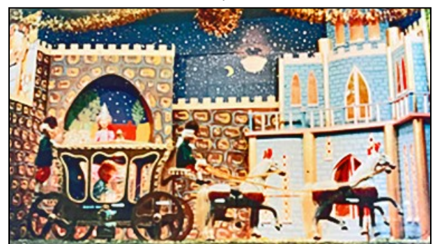
Cinderella arrives at the Ball