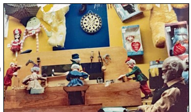
The Toymaker supervises his elves