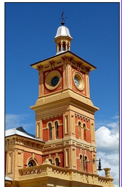
Albury Railway Station, State Heritage Listed, on the Register of the National Estate, Local Heritage Item listed on Albury LEP 2010

There are 245 listings on Albury's LEP and sixteen Heritage Conservation Areas. Details of all listings can be found at NSW State Heritage Inventory .