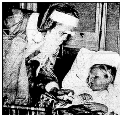
Santa visits Albury Base Hospital

South Albury Tennis Club held their Christmas party at South Albury Hall. The paper had a lovely photo of a young lady providing cigarettes at the event entitled the 'cigarette girl' (not something we condone today).