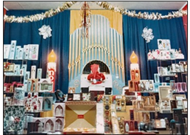
Santa in the cosmetic gift ideas window, 1968

The other permanent Christmas window display was the Toymaker's window but each year the toy display around the Toymaker scenes changed to show off the latest and most desirable toys for the Christmas season. The elves are at their