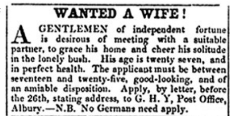
A Border Post advert, May 1859

It is probably safe to assume that in the early days of Albury, single men outnumbered single women. The Border Post in May 1857 had the following article "Domestic Servants. — The scarcity of female domestics in Albury has now become painfully apparent, and it is a matter of impossibility to procure them at any rate of wages ... should this paragraph meet the eye of Mrs Chisholm, we trust that lady will send us an early consignment of the softer sex."