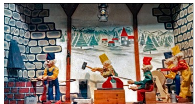
Santa's elves at work