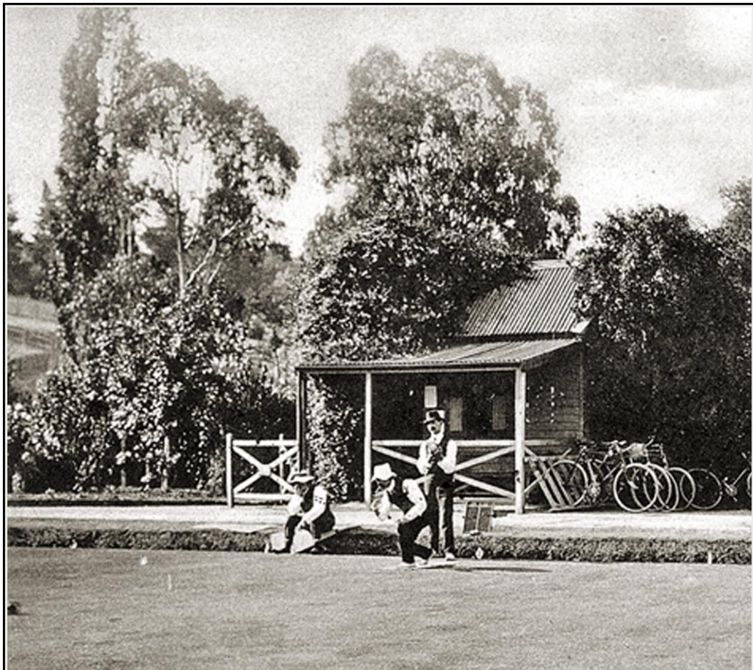
After customs were lifted the small building became the clubhouse when Albury Bowling Club opened its rinks in the Botanic Gardens.

end of the Union Bridge. In those days the formalities necessary to entitle one to cross from one Colony to the other were just as exacting as if one were crossing from one foreign country to another."