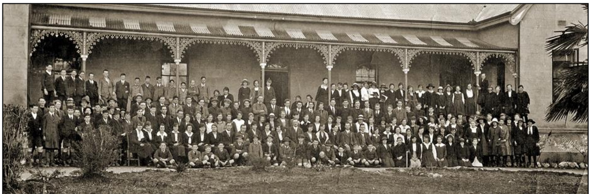
200 pupils assemble on the first day of Albury High School, February 2, 1920 in the old Albury Hospital building, Thurgoona Street.

The first home of Albury High School was the old Albury District Hospital on the south-west corner of Thurgoona and Pemberton Streets, next to Albury Gaol and virtually looking down Stanley Street.