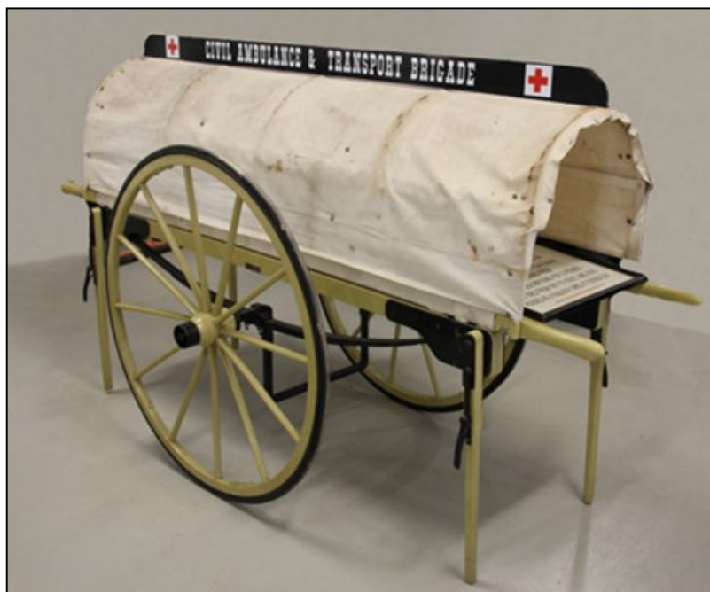
A NSW Ambulance litter from 1911

A second litter, purchased for £36, arrived in June 1909 – both litters had to be purchased from public subscriptions.